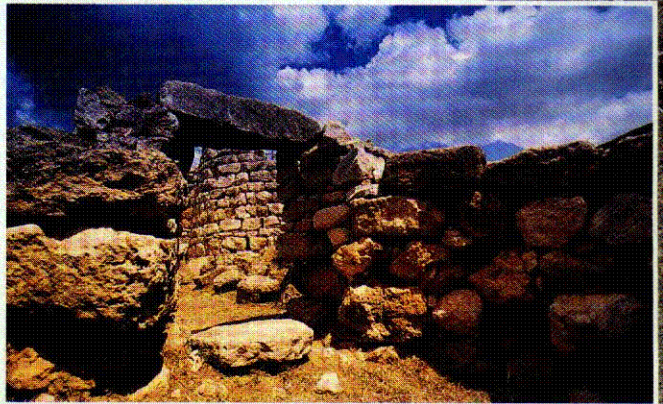
The main tower of Nuraghe Palmavera, a limestone and sandstone tower complex near Alghero in northwestern Sardinia, as viewed through the doorway of one of the three circuit wall towers, above. The staircase, left, leads into the domed chamber of the sacred temple well at Santa Cristina, a Nuragic sanctuary complex at Paulilatino in west-central Sardinia.

Unlike the similarly constructed Mycenaean tholos tombs, which the Sardinian towers predate by a few centuries, the nuraghi were used as residences. Excavations in the towers and surrounding villages have produced abundant evidence of cooking and domestic activities, as well as workshops for the manu-